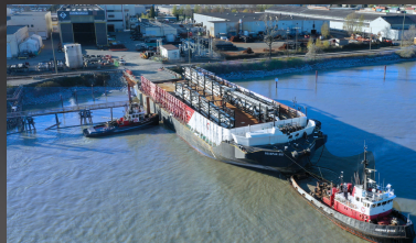
DIRECT WATER ACCESS