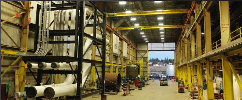
6 FABRICATION BAYS & ADDITIONAL LAYDOWN SPACE